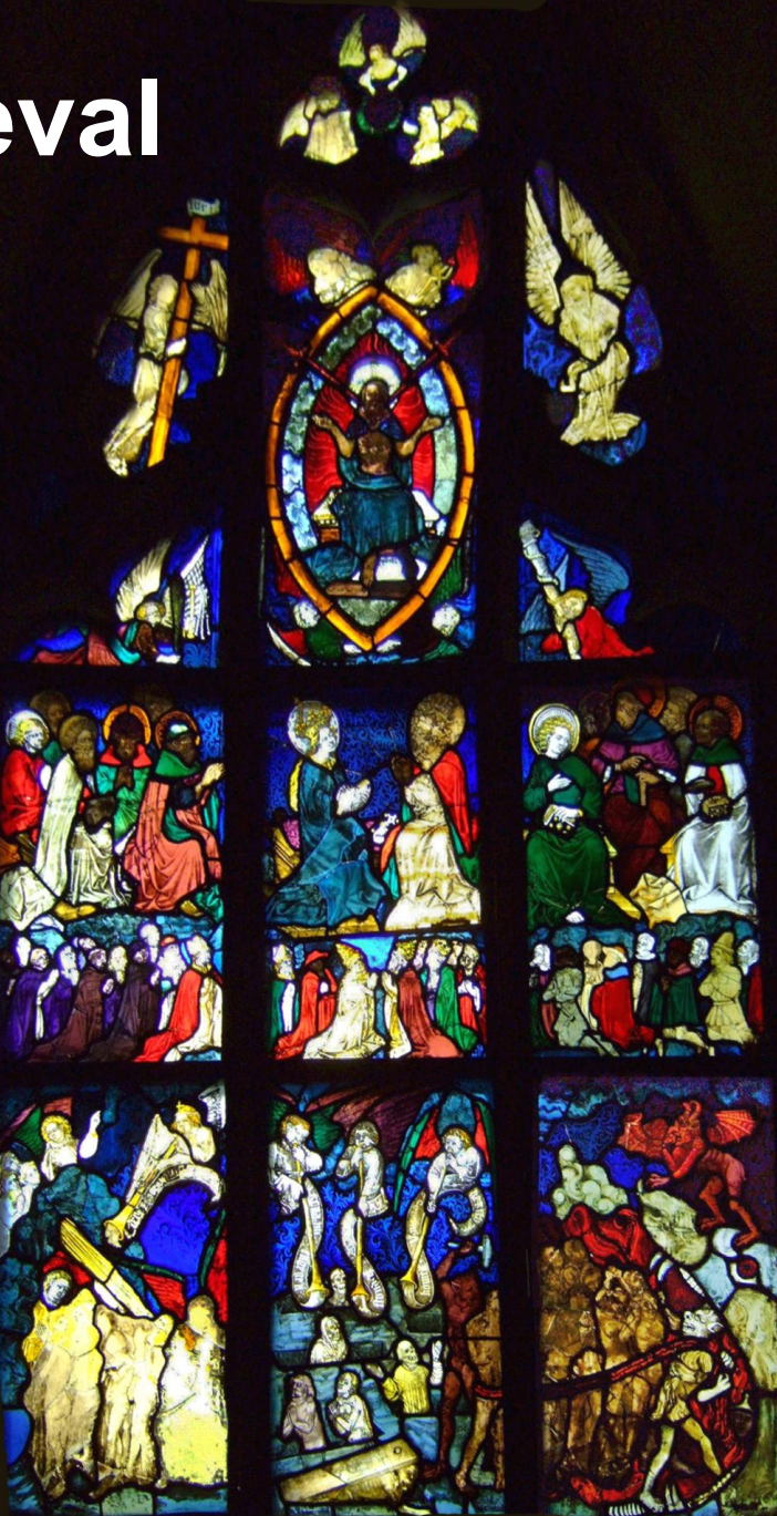
The Last Judgement Panel, Ulm Minster, Germany, 13th c.