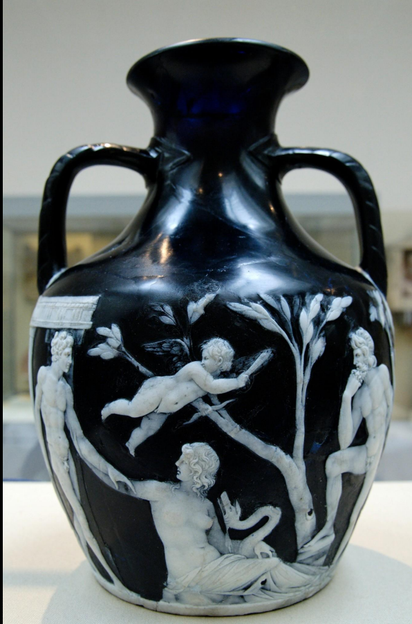
Portland Vase, Italy, 5-25 AD, Collection of the dukes of Portland

Both the Egyptians and the Romans were skilled at making small objects out of colored glass.