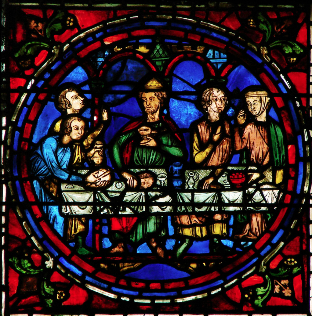
Detail of the Last Supper, 13th c., Chartres Cathedral, France