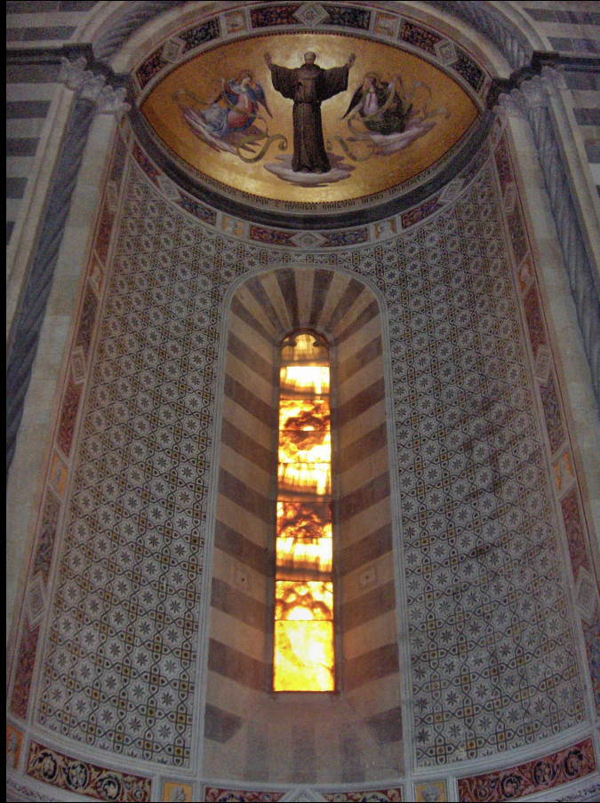
Cathedral of Orvieto, Italy

The Early Christian churches set thin pieces of alabaster in wood which produced a stained-glass like effect.