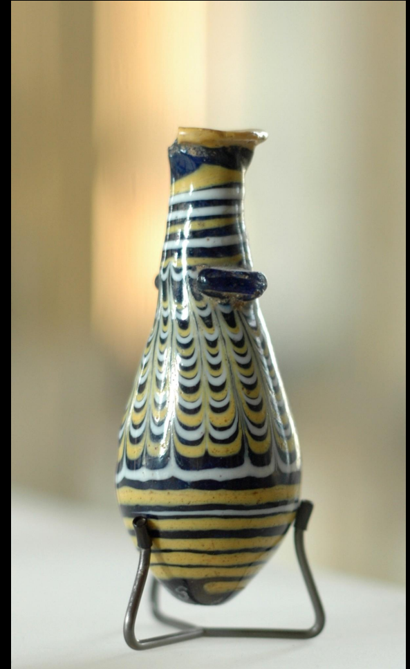
Roman Perfume Flask, 100 BC-200 AD, Louvre